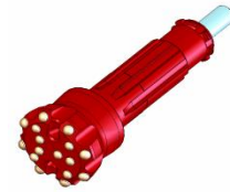
IR 340A Bit Shank

ROCKMORE INTERNATIONAL Rock Drilling Tools